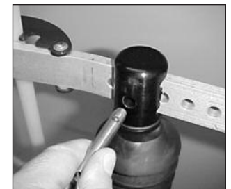
Clevis pin and clamp arm