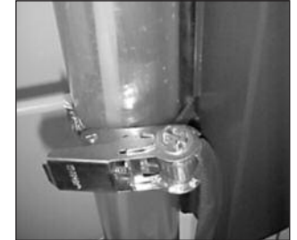
Ratchet tie-down belt

Open the Tubing Clamp located on the adjustable clamp arm and place the tubing in the clamp's jaws, leaving enough tubing (approximately 5 feet) above the jaws to allow the tubing to reach the tubing discharge clamp, and then tighten the clamp until the jaws are completely closed. The tubing clamp is designed to accept 1" OD, 5/8" OD and 1/2" OD polyethylene or Teflon tubing. Now position the tubing such that it will not chafe on the well casing and lock the clamp arm in place by inserting the clevis pin through the fork and the mating hole in the clamp arm.